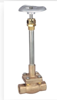
DIMENSIONAL TABLE ( K. M. )

Standards Applied: Cryogenic Bronze ASTM 93700, Valves and components provided cleaned for use in oxygen according to ASTM CGA G4.1